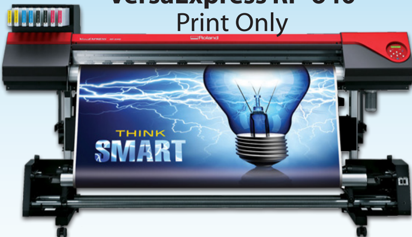
Roland 64" VersaExpress RF-640 Print Only